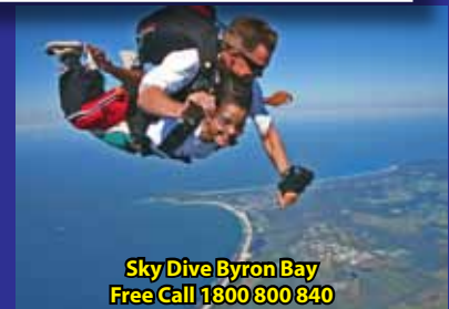
Sky Dive Byron Bay Free Call 1800 800 840