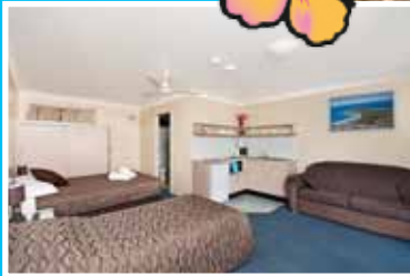
Double Twin Room