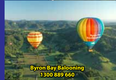
Byron Bay Ballooning 1300 889 660