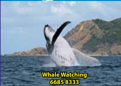
Whale Watching 6685 8333