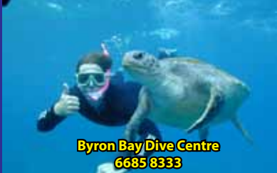
Byron Bay Dive Centre 6685 8333