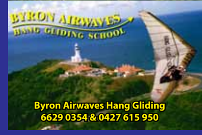
Byron Airways Hang Gliding 6629 0354 & 0427 615 950