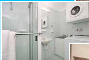
Bathroom with Washing Machine and Dryer