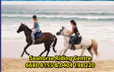
Seahorse Riding Centre 6680 8155 & 0404 198 220

The many beaches around Byron Bay offer clean warm water and the chance to see dolphins regularly and whales through October. With water temperatures averaging 26c summer and 21c winter, many water activities can be enjoyed all year round.