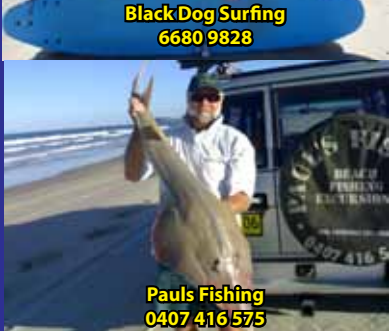
Pauls Fishing 0407 416 575