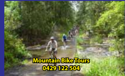
Mountain Bike Tours 0429 122 504