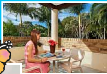
Relax on the Balcony