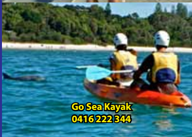
Go Sea Kayak 0416 222 344