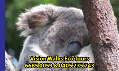
Vision Walks Eco Tours 6685 0059 & 0405 275 743

GETTING HERE TRAVEL http://iwantthatflight.com.au for discount International & Domestic Flights Car Rental, Airport Shuttles, Byron Bay Airbus, Byron Bay Airport Transfers, Xcede, Byron Easy Bus, Brisbane to Byron 2 hour express, Steve's Tours Airport Express Countrylink Train 132 232 Greyhound Coaches- 132 232 Byron Bay Taxis 6685 5008